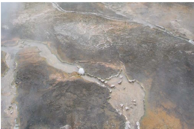
ROTORUA-the volcanic heartland

THE MAGMA SHORT FILM FESTIVAL is now a three day festival programme to be held in Rotorua, New Zealand, May 01-03, 2009 at the revamped Shambles Theatre.